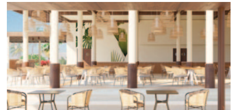
Beach Club Grill Restaurant