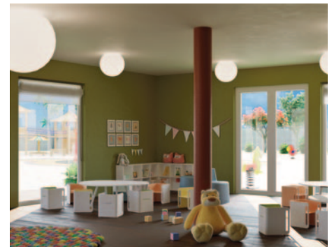
Dolphin Kids Club

Wild at Heart, the Resort authentic African essence is perfect for romantic getaways, family vacations, and unique adventure experiences. Available for guests a Convention Center, an air-conditioned Gym & Sport Center , a Diving & Water Sport Center and, for the younger members aged 3-12, the biggest Dolphin Kids Club in Zanzibar with an array of playful indoor and outdoor games and facilities in the safety of the enclosed private resort. Moreover, for guests looking for a more relaxing experience and a space that aligns soul and nature, there is The Emerald SPA with world-class treatments.